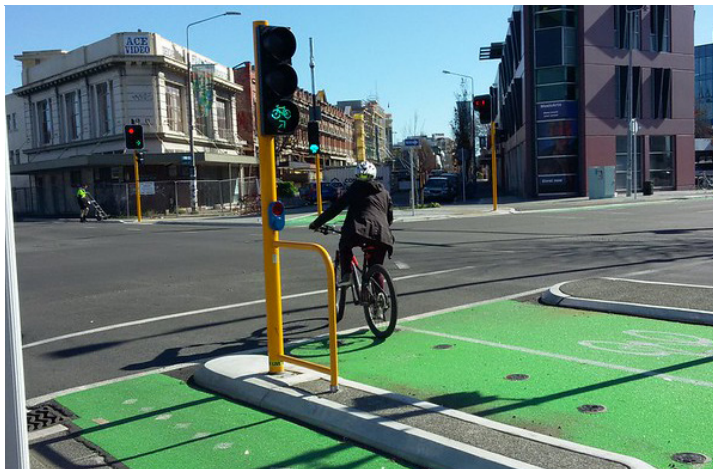
Directional cycle signal trial, Christchurch

ViaStrada is a team of dedicated transport planners and engineers with a wealth of experience in all transport modes.