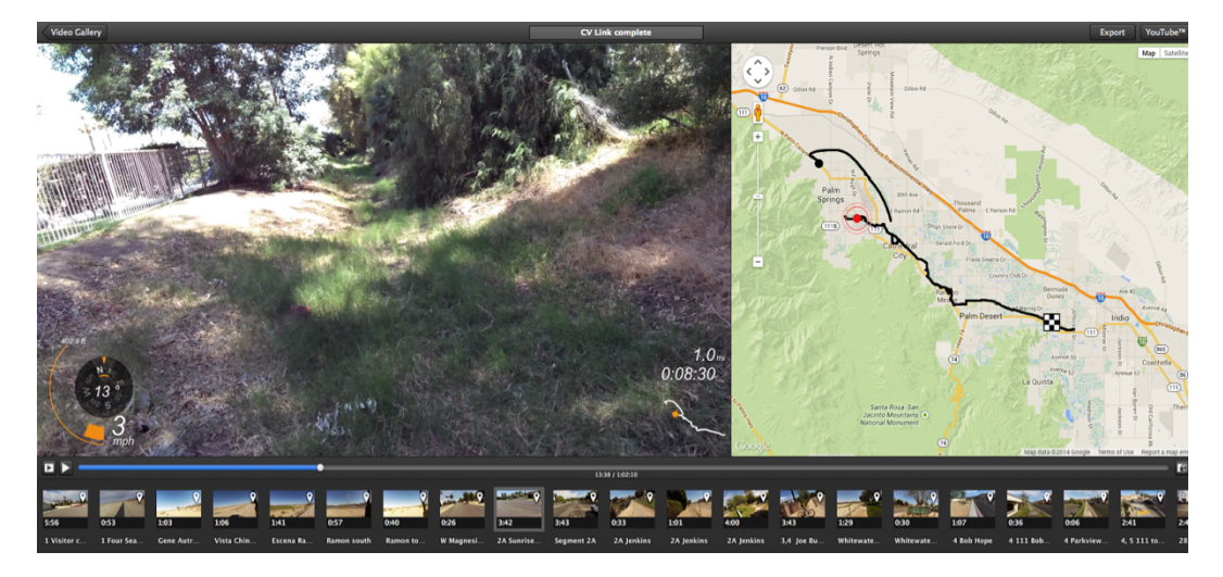
Figure 7: Screenshot of CV Link existing conditions video

For many projects, Google "Streetview" provides an invaluable way to assess existing conditions before or after a field visit. The CV Link route alignment is to follow many corridors where there is no street level imagery available. For long corridors where a simple site walk and camera is insufficient, there are at least two emerging technologies for capturing video – use of an aerial drone, or use of a video capture device. For this project a Garmin VIRB (similar to the popular GoPro) was selected because it has inbuilt GPS geotagging and can associate captured video with the familiar Google Maps interface (Figure 7). The device registers gradient in addition to location.