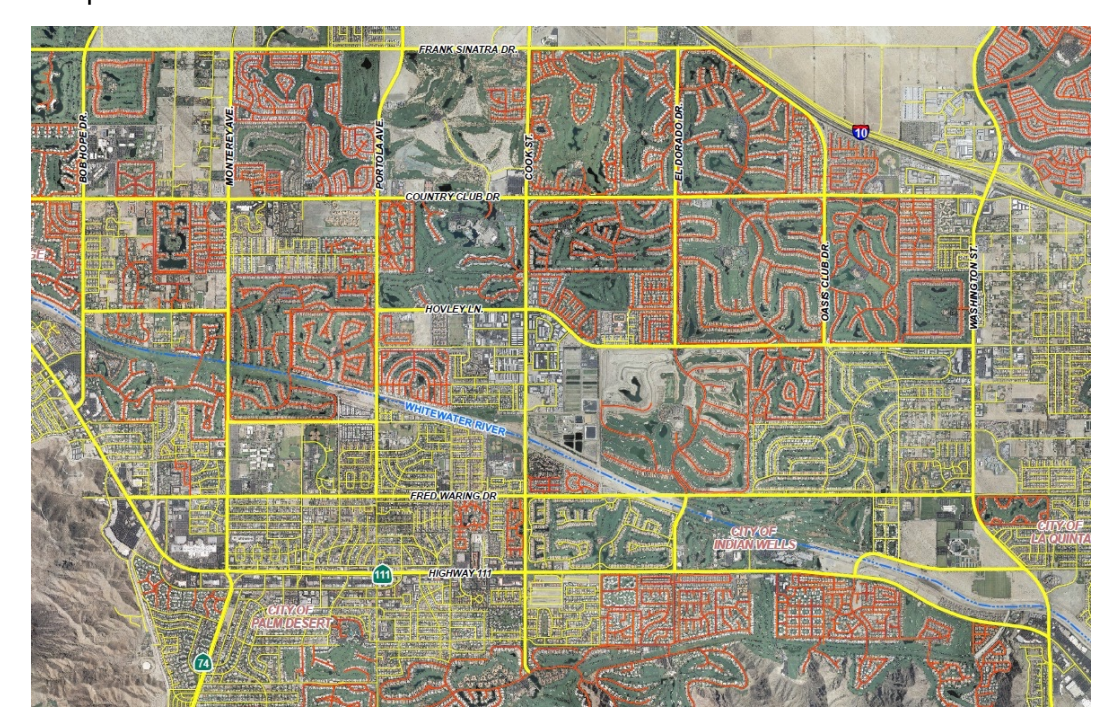
Figure 3: Road connectivity in the central Coachella Valley. Yellow routes are public access and typically multi-lane arterials (thick lines), whereas red lines indicate private gated streets.

CV Link will address some of the transportation deficiencies and associated social problems caused by the Coachella Valley's current car-oriented transportation infrastructure (Alta Planning + Design 2016) and economically segregated land uses. Currently, pedestrian and bicycle travel is inhibited by the lack of available safe corridors, an indirect road system characterized by gated communities (Figure 3), and high arterial speed limits (typically 70 to 90 km/h). CV Link will provide direct access to six schools and numerous public destinations such as shopping centres, libraries and parks.