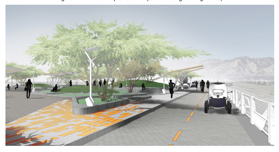
Figure 2: Rendering of a focal point, with shade structures, seating walls, and coloured pavement markings